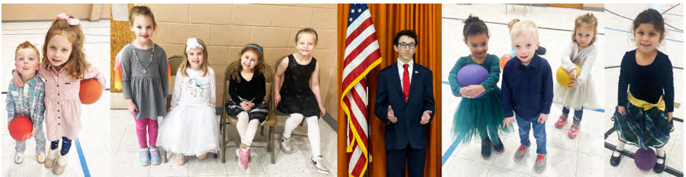
Lutheran Schools Week: Connected to Jesus - Dress Your Best Day.