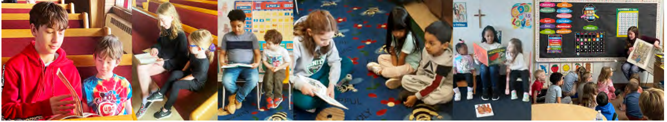
Lutheran Schools Week: Connected to Sharing - Older students read to younger children.