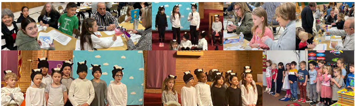
Lutheran Schools Week: Connected to Family - Grandparents' Day with special chapel.