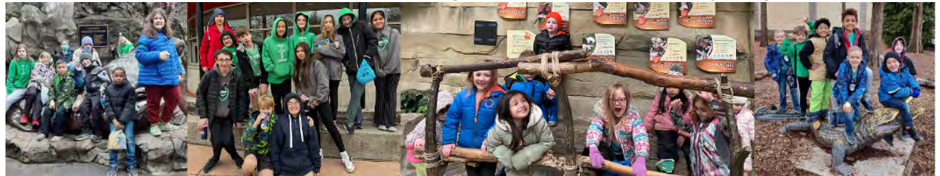
Lutheran Schools Week: Connected to God's Creation - Field trip to Brookfield Zoo.