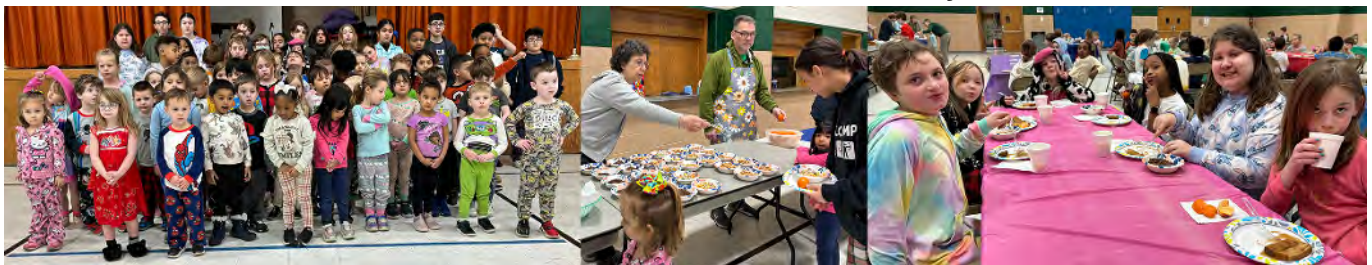
Lutheran Schools Week: Connected to Serving - Pajama Day and teacher-served breakfast