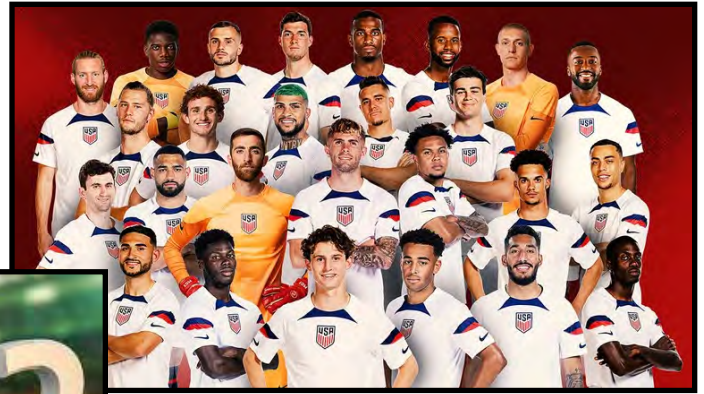
The United States Men's National Soccer Team

At the 2022 FIFA World Cup, Team USA finished 14th out of 32 participants in Qatar.