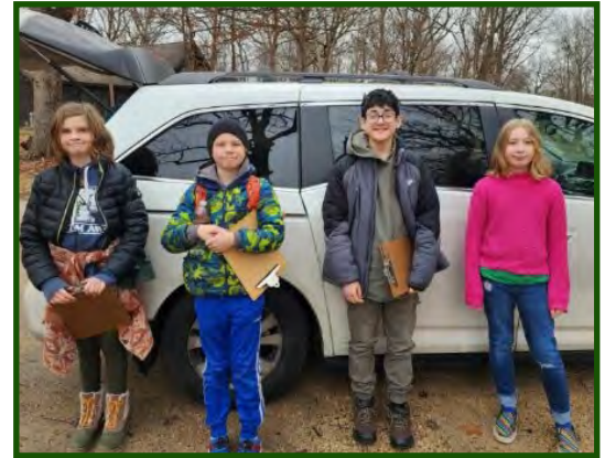
Trinity's 6th through 8th grade students (above) and 5th grade students (below) smile upon arriving at Walcamp.