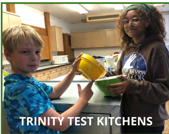
TRINITY TEST KITCHENS

Everyone, get ready to preheat your ovens, National Zucchini bread day is April 25, 2023. On this day we celebrate by making zucchini bread! All you need for zucchini bread is 2 c. flour, 1 t. salt, 2 t. leaveners, (baking powder or baking soda act as leaveners), 1 t. cinnamon, 3 eggs, 3/4 c. oil, 1 1/2 c. sugar, 1 T. vanilla, 3 c. Shredded zucchini, and 1 1/2 c. nuts.